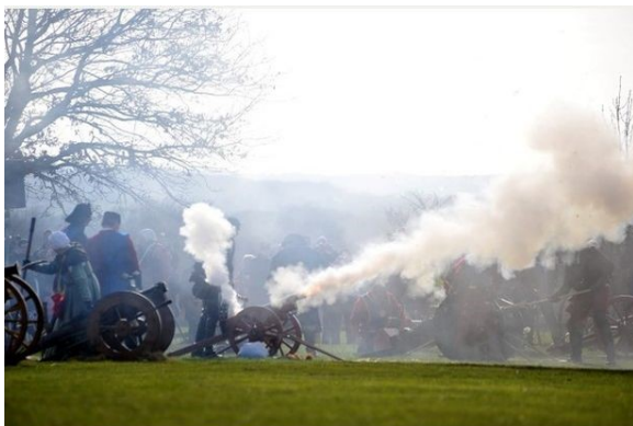
Bosworth Battlefield

Historians consider the Battle of Bosworth to mark the end of the Plantagenet dynasty, making it a defining moment of English and Welsh history.