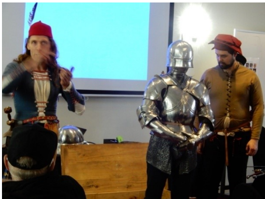
Arms and armour