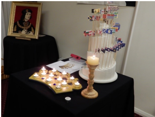
Candle ceremony and flag castle

The Banquet - okay let's make you hungry! After canapés and mulled wine and the welcome, the candle ceremony followed. First remove- pea and bacon broth, herb and cheese tartlets, bread and butter, hedgehogs, raisins and almonds. Michael and Yvonne Illiffe then brought in the Subtlety. The second remove- roast pork, roast chicken, savoury pie, buttered parsnips, carrots and leeks, apple sauce with cloves and lemon. The Loyal toasts to the Queen, King Richard and the friends of King Richard were proposed. The third remove was apple pie with cream, strawberries with cream, dates and figs, plus slices of the subtlety. White and red wine and ales were available to drink.