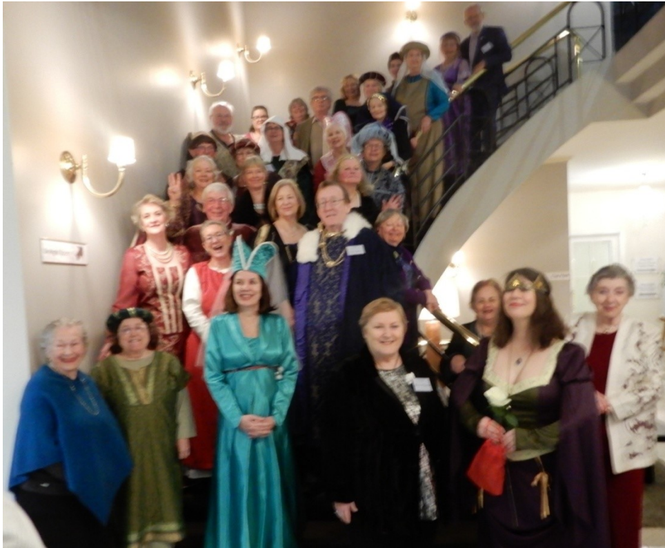
here we are!