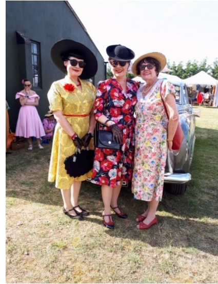
Beautiful 1960s Rolls Royce. The owner took our photo.