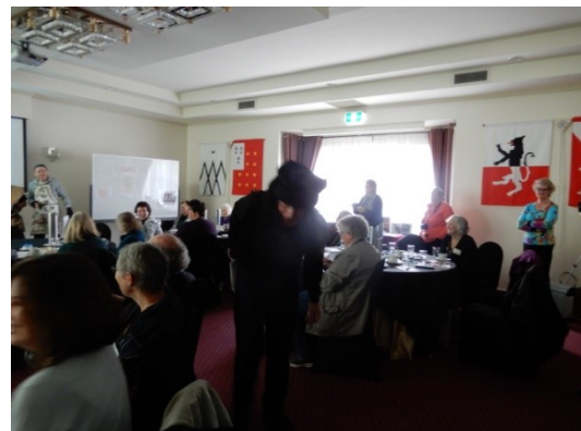
getting the hump