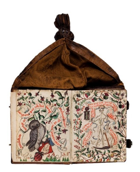
The Karlsruhe girdle book from Germany.

"You close your eyes," she says. "As a bookbinder, I have learned to trust my fingers more than my eyes."