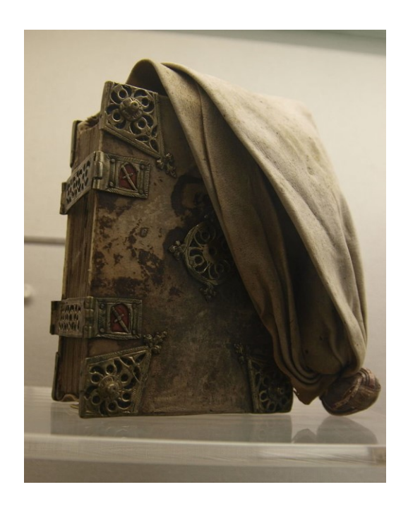
Girdle books were often very plain. This one, from Nuremberg, is the most ornate one known.