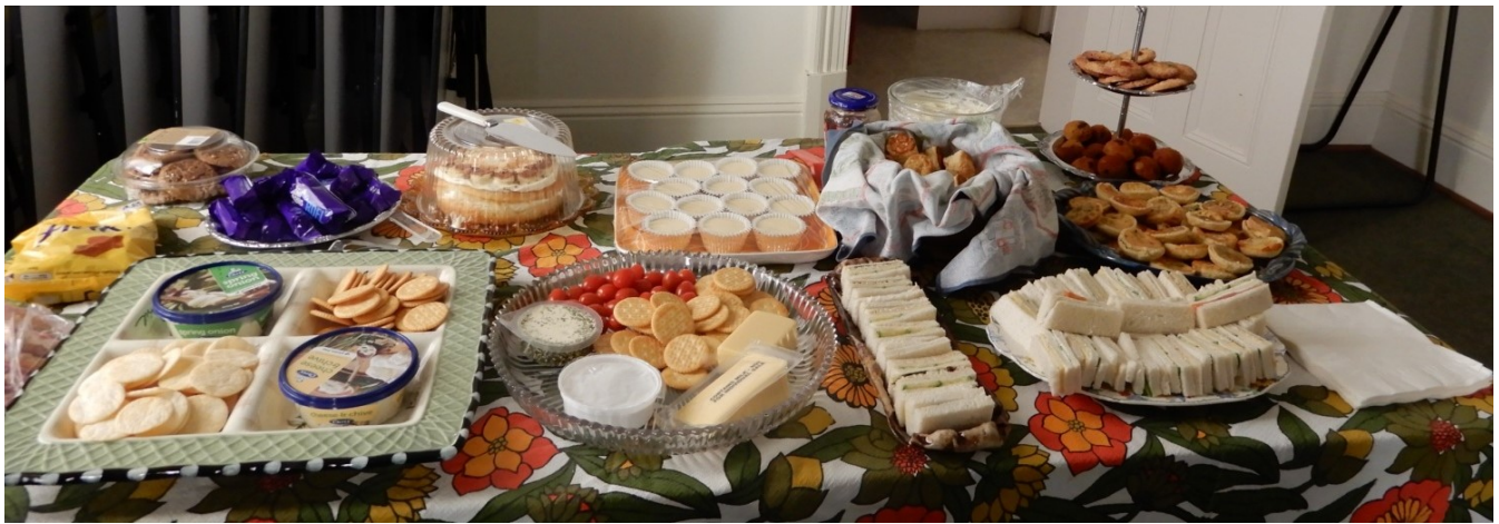
Our High Tea also included a choice of 5 different teas and coffee.