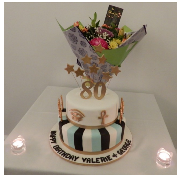
The cake-Egyptian top, Port Power bottom