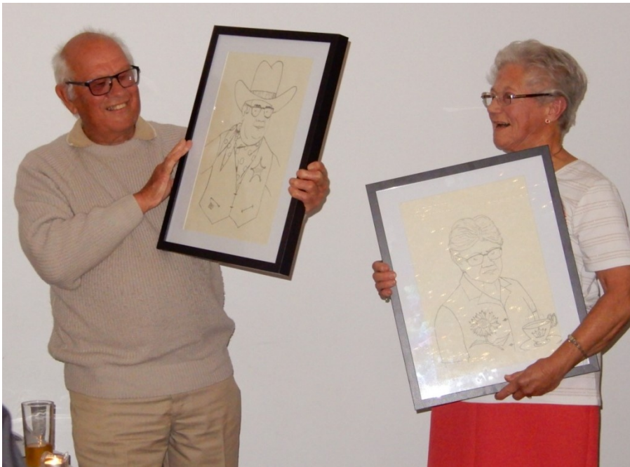
Portraits of the pair, one of their presents.